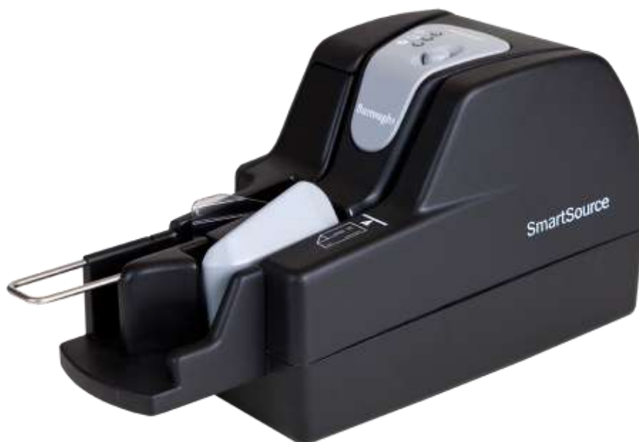
Figure 1–1. SmartSource Open Professional (Single-Pocket Model)

Based on the latest technology for distributed capture devices and over five decades of company experience, SmartSource devices have a compact and ergonomic design with full-featured document processing and “state-of-the art” image processing and security capabilities. A SmartSource Open Professional device is shown in Figure 1–1.