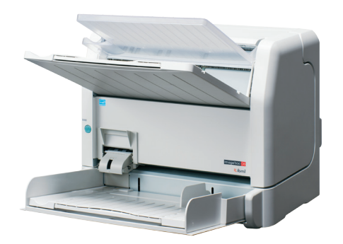
Powerhouse processing that sits on your desktop.

Contact ibml at sales@ibml.com or visit our website at www.ibml.com.