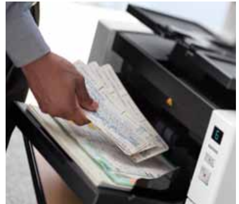
SurePath Paper Handling automatically adjusts for a variety of document sizes and thicknesses.

Optional Kodak Legal Size and A3 Size Flatbed Accessories for added capability to scan bound, oversized and fragile documents.