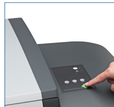
One-touch scanning: The entire image in just 4 seconds