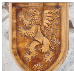
Odd-size materials – carvings