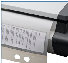
Oversize document scanning

The large flatbed surface provides great flexibility for creativity, careful document handling, oversized and book scanning.