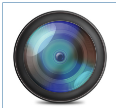
One camera, one perfect image, no stitching