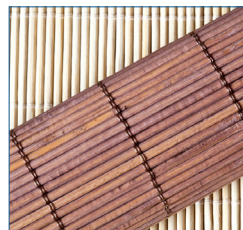
Wood, bamboo and similar