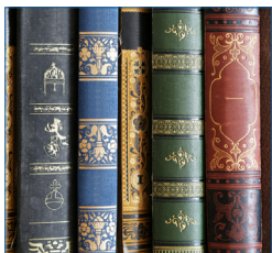
Odd-size items – books